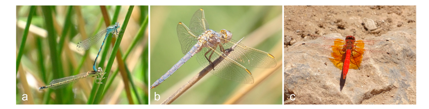
Figure 3. Pictures of some odonate species found in this study. ( a ) Coenagrion mercuriale; ( b ) Orthetrum nitidinerve (Mediterranean endemic); and ( c ) Trithemis kirbyi .

Table 2. Checklist with frequency and altitudinal range of odonate species recorded in this study.