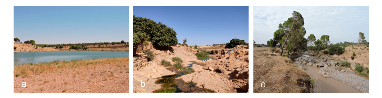
Figure 2. Habitat types surveyed in this study. (a) pond (Site 3); (b) stream (Site 6); and (c) river (Site 18).